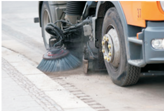
Street cleaning/snow clearance